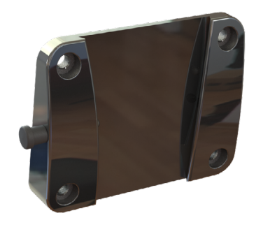
Stainless Steel Mounting Bracket with 8º Draft