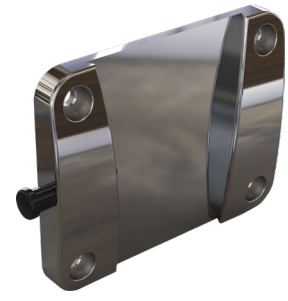
Flush Mount Stainless Steel Mounting Bracket